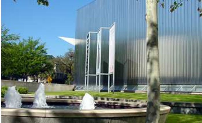
Contemporary Arts Museum Houston