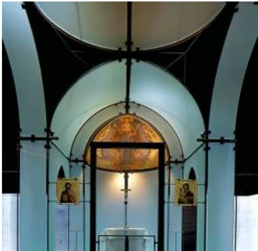
Byzantine Fresco Chapel

Our day begins at the Menil Collection with a specially-guided back-of-the-house tour. Housed in a building designed by Italian architect Renzo Piano, it was opened in 1987 to preserve and exhibit philanthropists John and Dominique de Menil's art collection – one of the most significant of the 20 th century. We will enjoy a private tour of the collection – including Cycladic, tribal and 20 th -century American and European art. Several other important spaces accompany the museum, and on a walking tour of the area we will visit the Rothko Chapel housing 14 Mark