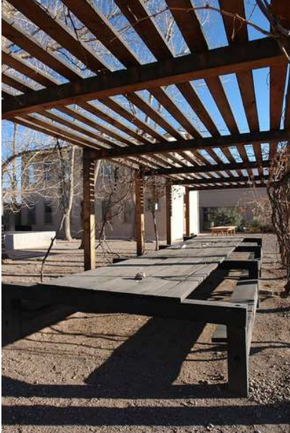
La Mansana de Chinati/The Block

This morning's visit has been arranged at the specially-opened Judd Foundation, which holds and maintains Donald Judd's private living and working spaces. It is comprised of a total of 15 spaces, including studios installed with art work – by Judd and others – living quarters, ranch and architecture offices, and libraries.